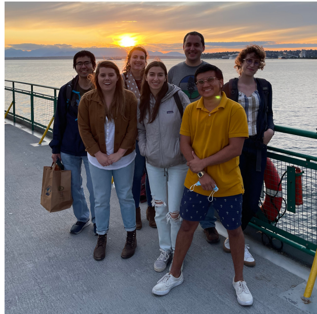
Riding the Bainbridge Island Ferry from a happy hour

YPT Seattle has held many different types of events ranging from webinars, to design charrettes, group bicycle rides, happy hours, and technical tours. During the heights of the COVID-19 pandemic we held virtual events to keep our members engaged and connected. In mid-2021 we began to resume in-person events when possible in accordance with local guidelines. All programming that YPT Seattle creates commits us further to our mission of providing networking opportunities, professional development, and camaraderie.