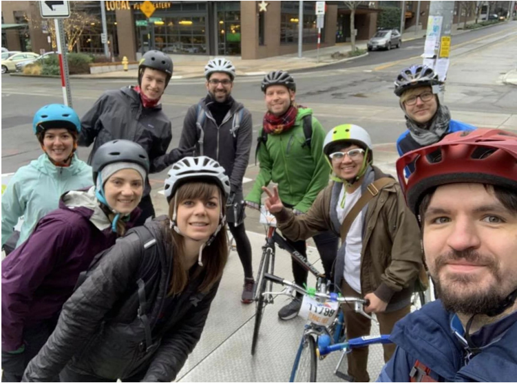
Group bike ride + brunch event