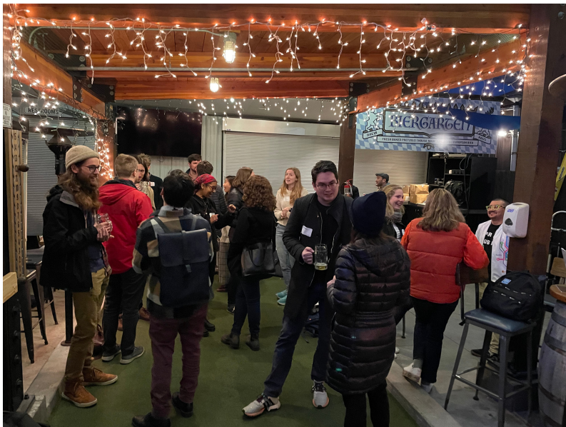
Transit Oriented Drinks (TOD) event

In addition to annual sponsorships, we welcome contributions targeting events of specific interest to your organization. We also welcome in-kind contributions of staff time, supplies, facilities, etc.